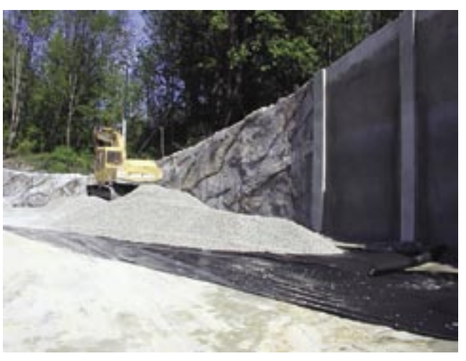
Fig. 5: Snohomish County Waste Transfer Station, Mountlake Terrace, WA. This wall was originally specified as cast in place

similar-size structural projects within the past 5 years.