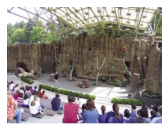
Fig. 9: Welcome to the Jungle, Tacoma, WA