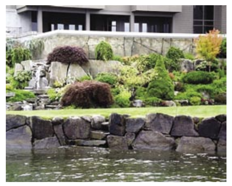
Fig. 6: View from the lake

shotcrete can be very competitive with other options without significant design changes. With just a few careful steps, you will be ready to "rock!"