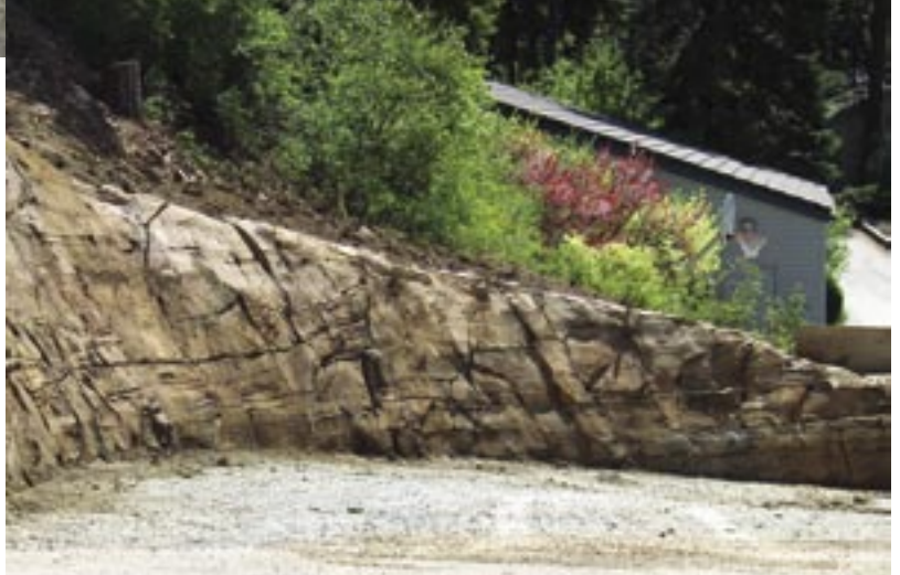
Fig. 2: A creation for a private home in Coeur d'Alene, ID, made to look like a natural rock formation