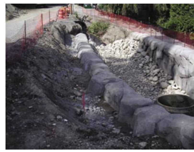
Fig. 4: Artificial stream catch basin

2. The shotcrete contractor should employ ACI Certified Nozzlemen and should have completed