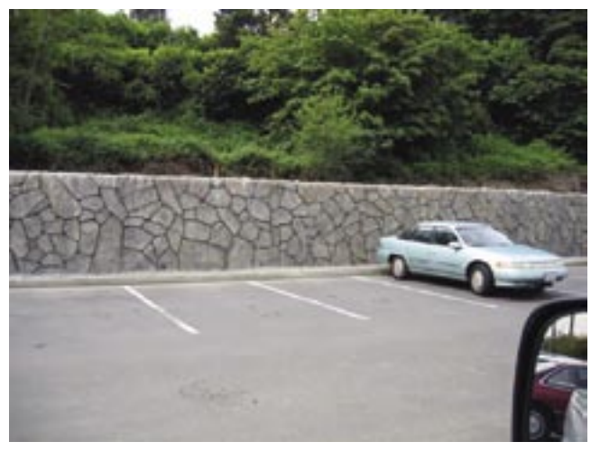
Fig. 3: Carved granite stone rockery in Tacoma, WA